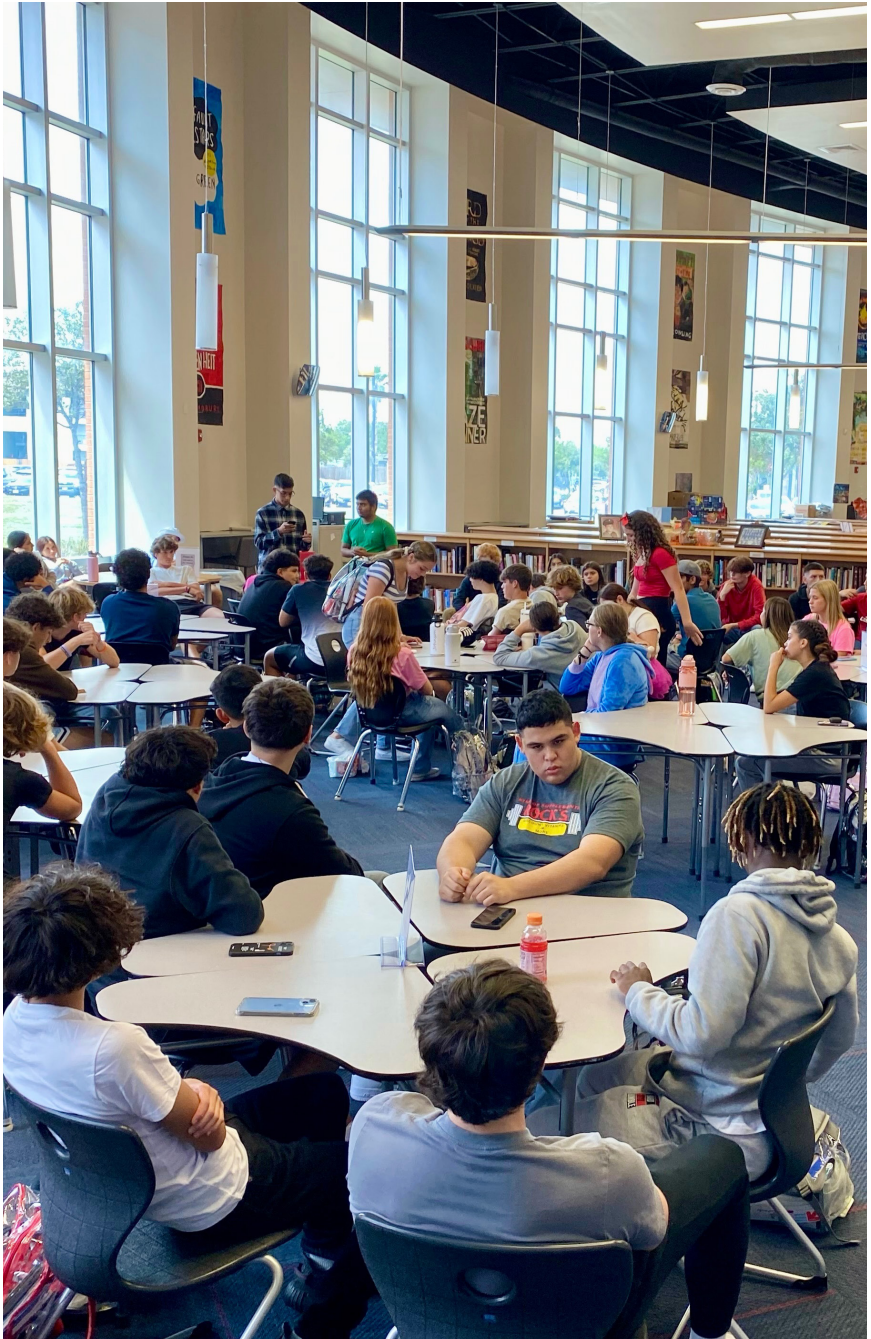
VMHS Bible club. Having outgrown several classrooms and meeting spaces, the Veterans Memorial Bible Club meets in the school library. It is one of the only places on campus that can hold the growing number of students in attendance.